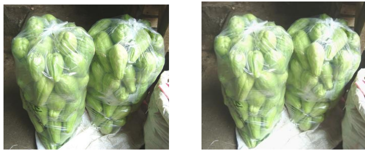
Fruits packed in Polyethylene Plastic