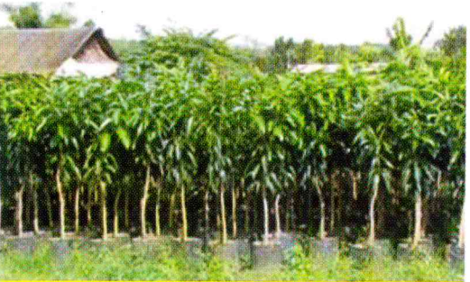
Available Plant Materials