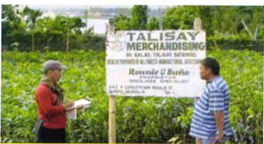
Monitoring and Evaluation of Accredited Plant Nurseries

Implementation of Plant Nursery Accreditation Program in which both government and private nurseries are being accredited.