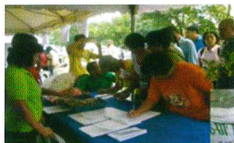
Seed and Flyer Distribution

Distribute quality seeds and planting materials to various stakeholders (farmers, students and etc.)